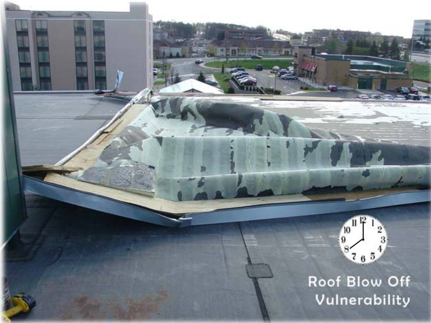
Roof Blow Off Vulnerability